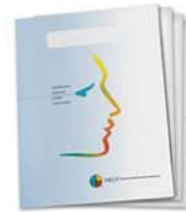
All Products / Self Service Processing HBDI® PACKAGE MATERIALS FOR SELF PROCESSING SET OF 10