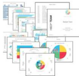
All Products / Self Service Processing HBDI® UNLIMITED REPORTING FOR SELF PROCESSING