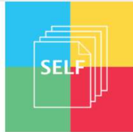
All Products / Self Service Processing HBDI® INDIVIDUAL PROFILES FOR SELF PROCESSING BUNDLE OF 10