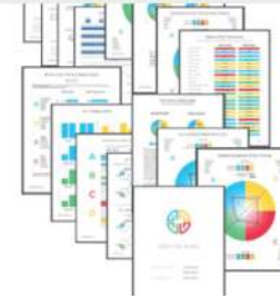
All Products / Full Service Reports & Materials / Self Service Processing HBDI® PAIR REPORT